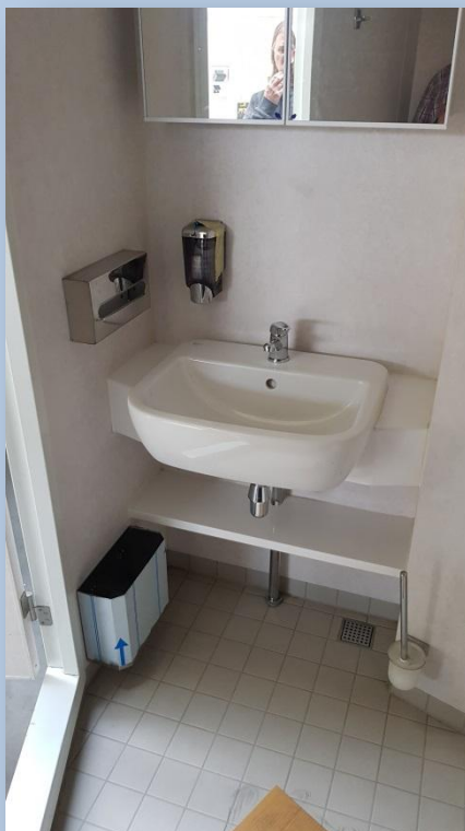
Sanitary unit type A/A1 KK24-16/35-800/D-101